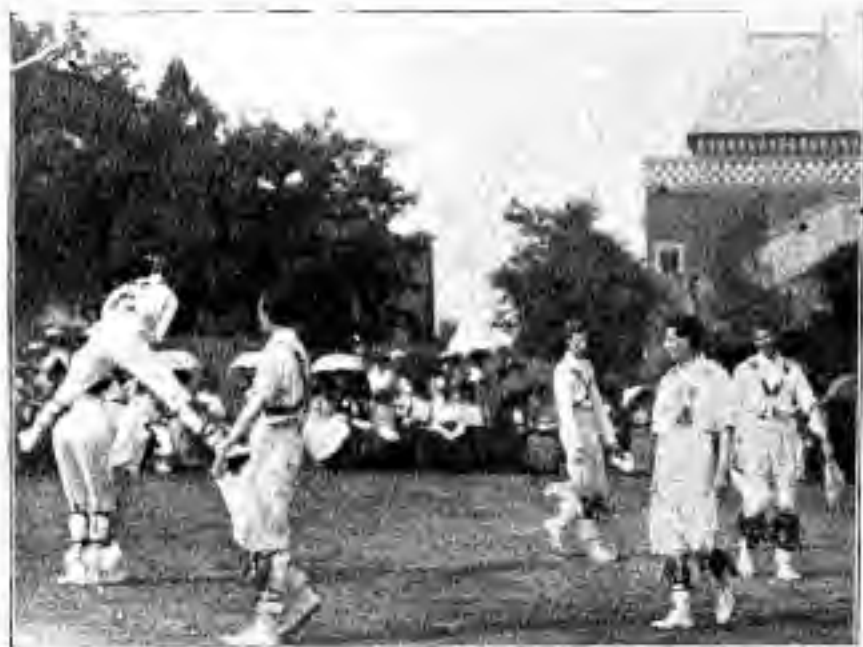
LEAP-FROG, MORRIS DANCE BY E.F.D.S. TEAM in the Shakespeare Memorial Theatre Garden